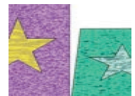
Optically Variable Inks