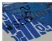
Tamper Evident Void